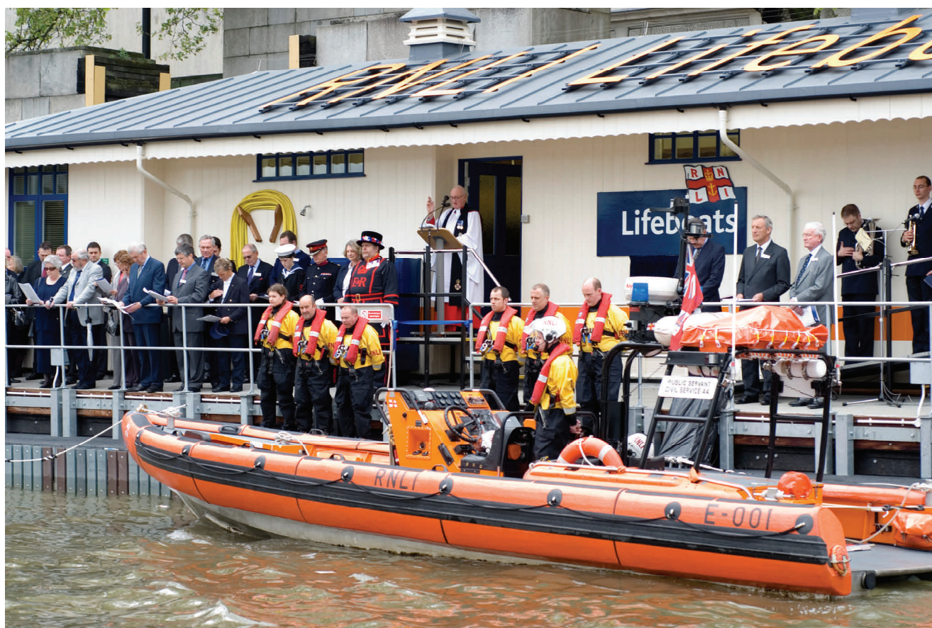
The opening of Tower lifeboat pier in 2006

Based on such a busy stretch of river, inevitably Tower lifeboat crew receive a large variety of 'shouts'. These range from assisting capsized rowers, sinking yachts, people ill or injured on board passenger vessels, people who jump into the river, boat fires, and people who have fallen into the water. The crew also provide a first aid response for anyone on or near the river, as they are frequently able to reach casualties quicker than the ambulance service as they do not encounter the same traffic difficulties. This speed of response can enable Tower lifeboat crew to provide life saving first aid until the ambulance service arrives to take over.