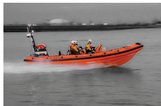
Left: Tower E class; Top right: Teddington D class; Bottom right: Gravesend Atlantic 85